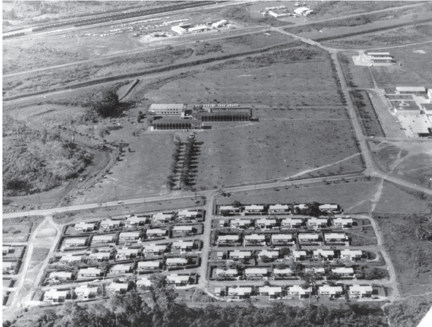
Yekepa Lamco Town, Liberia, 1960