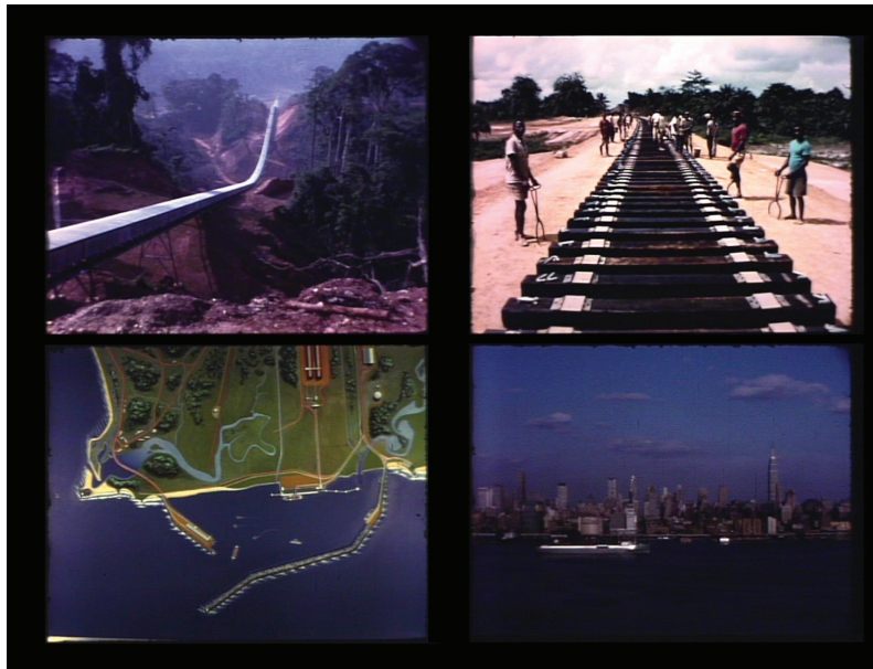
'Building a railroad in Liberia, 1970'