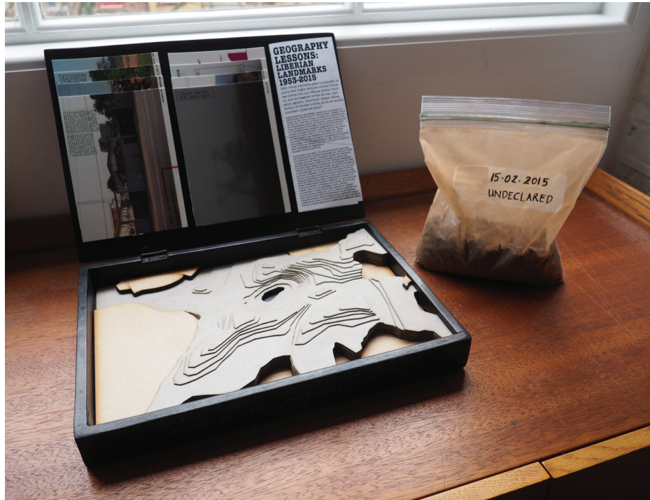
'Geography Lessons' teaching material, 2015