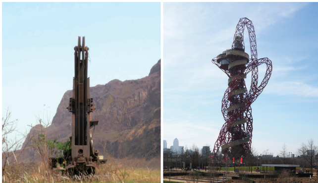
Left: Postcard, Coring drill Yekepa - The Orbit, London