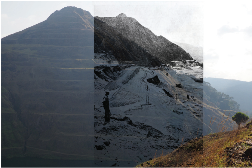
DEPLETING A MOUNTAIN - Peak One of Mount Nimba, showing the elevation before production began, and the pit which has resulted from the bites of 888 shovels with a bucket capacity of ten tons each. See story on LAMCO's first 25 million tons on page 4.